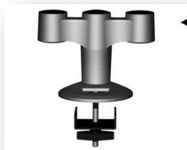
Optional Grommet Mount

Our optional dual arm grommet mount provides added stability; will fit standard grommet holes; reference part no. EF-D-GT-P